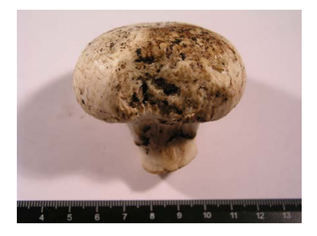
Figure 1. Browning and lysis of fruiting bodies of champignons

To study viral pathogens of mushrooms samples with specific symptoms and without them were used. During the examination of the fruiting bodies of mushrooms in the mushroom farms of Vasyl'kivskyy, Kyevo-Svyatoshynskyy and Makarivskyy districts of Kyiv region and industrial mushroom enterprises of Kyiv in the period from 2006 to 2011 were selected 740 samples, in 87 of which were found symptoms of viral diseases. The objects of researches were fruiting bodies of champignons, compost, mycelium, roofing soil. For analyzes fruiting bodies with symptoms of disease were selected. In infected mushrooms during all waves fructification was observed. As control were fruiting bodies of champignons that were selected according to the results of visual assessment on damage and electronic-microscopic analysis in the laboratory conditions (Fig. 1).